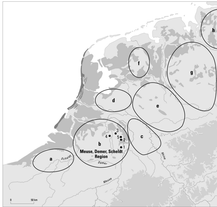
Fig. 1 | Pleistocene coversand landscapes in the Northwest European Plain. Legend: (a) Flemish sand plateau, (b) Meuse-Demer-Scheldt region, (c) Meuse-Rhine region, (d) Veluws-Utrechts plateau, (e) East Netherlands-Westphalian sand plateau, (f) Drenthe plateau, (g) Lower Saxonian sand region, (h) Elbe-Weser triangle. Legend for the location of the key sites discussed in this paper in the Meuse-Demer-Scheldt region: 1 Weert-Nederweert; 2 Someren; 3 Lieshout; 4 Veldhoven-Zilverackers; 5 Deurne.